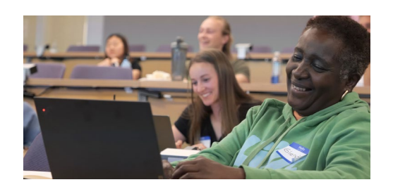
Support to Scale Incubator: Empowering Businesses for Growth

Early Stage Accelerator: Propel Your Business to the Next Level Are you ready to take your business to new heights? The Early Stage Accelerator, facilitated by Knox Street Studios (KSS), is designed to nurture small, diverse cohorts of 5-7 businesses and entrepreneurs, equipping them with the tools and skills needed for the next phase of their journey.