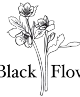
Clear Black Flowers

The deer fence/wildlife exclusion fence has been a complete game changer for our farm, saving us a ton of stress and money. Just a year and a half later, plants have been able to reach maturity and be productive in a way that would absolutely have not been possible before. Honestly, I probably would have given up by now if it wasn't for the grant funds that help build the fence.