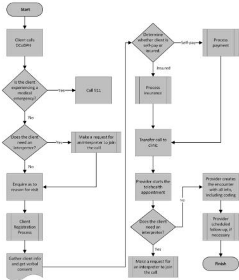
Appendix B: Telehealth Process for New Clients