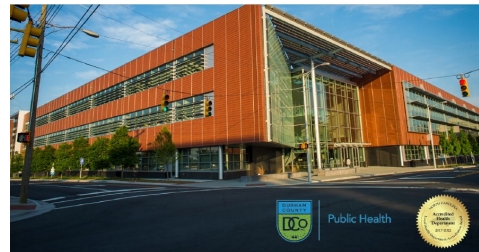
Employee Quick Reference Guide December 2022