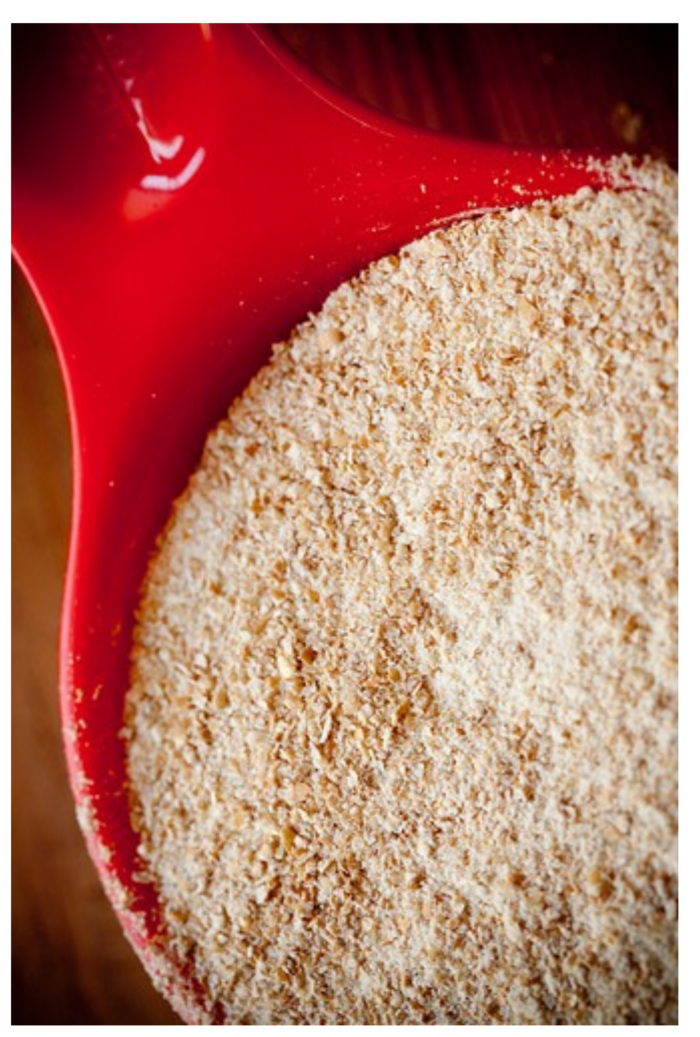
Whole wheat flour—contains the bran, germ, and endosperm