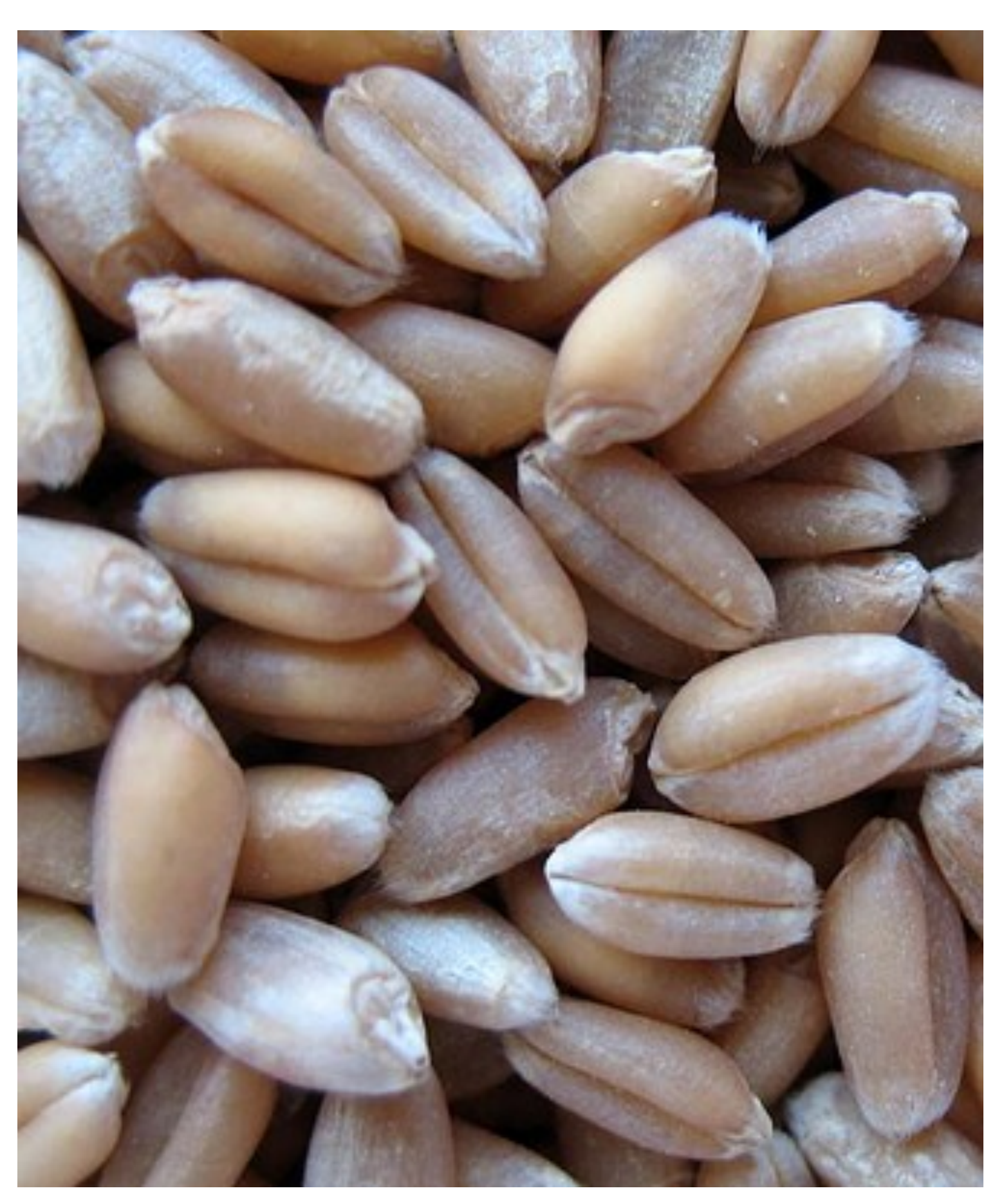
Wheat seeds are very small