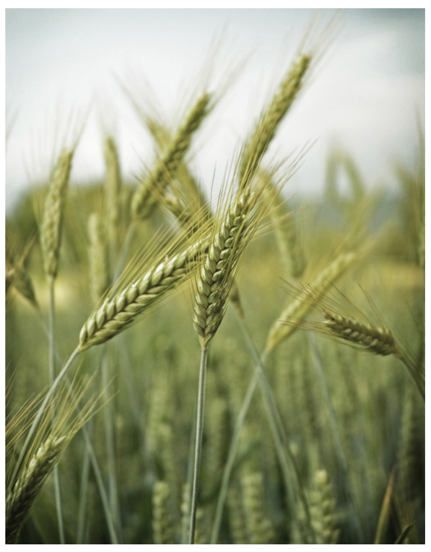
Wheat stalks grow in a field