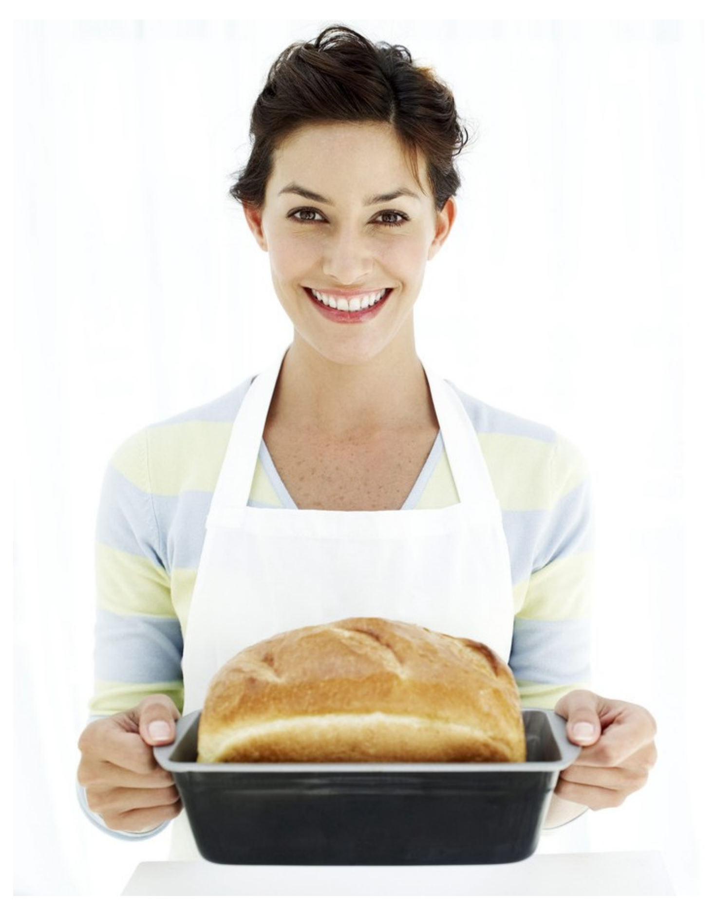
Dough is put in a pan and baked in the oven