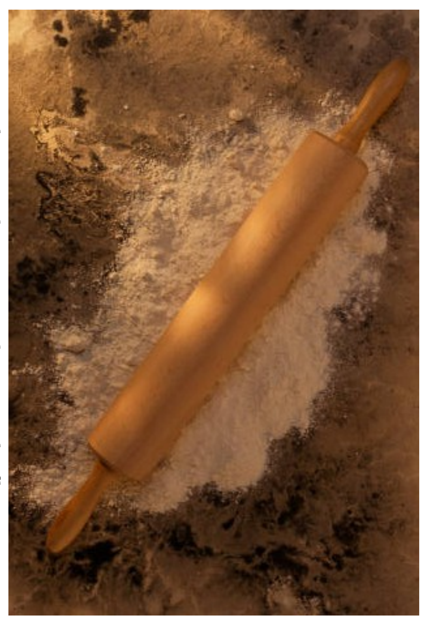
Wheat seeds are ground up to make flour.