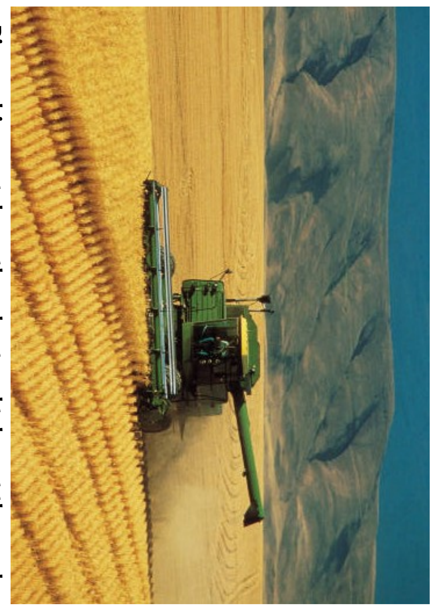
Big machines cut down the wheat and take out the seeds