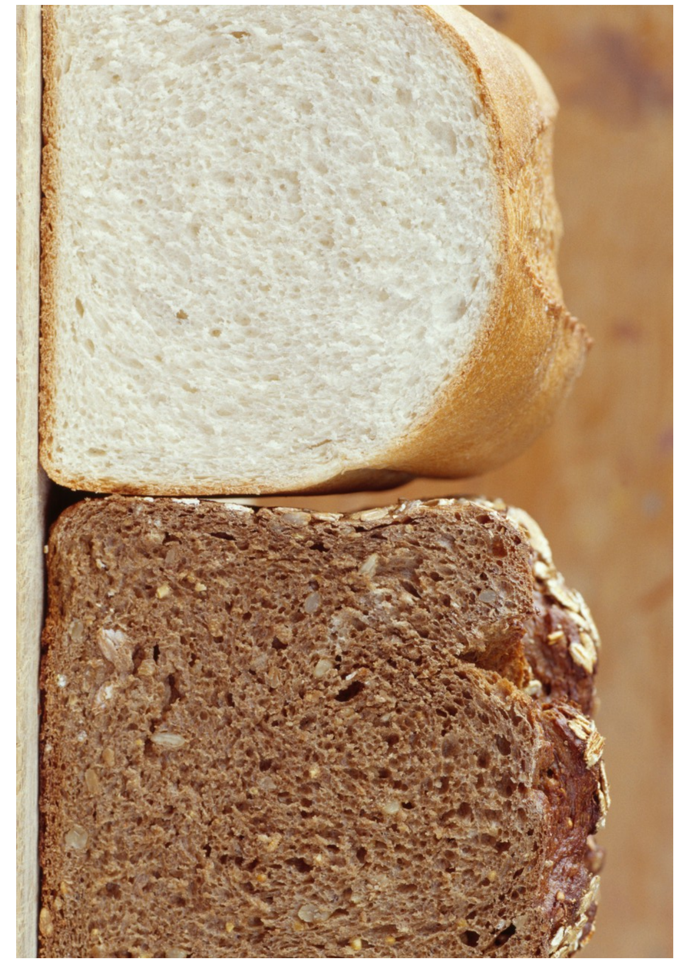
That is how bread is made!