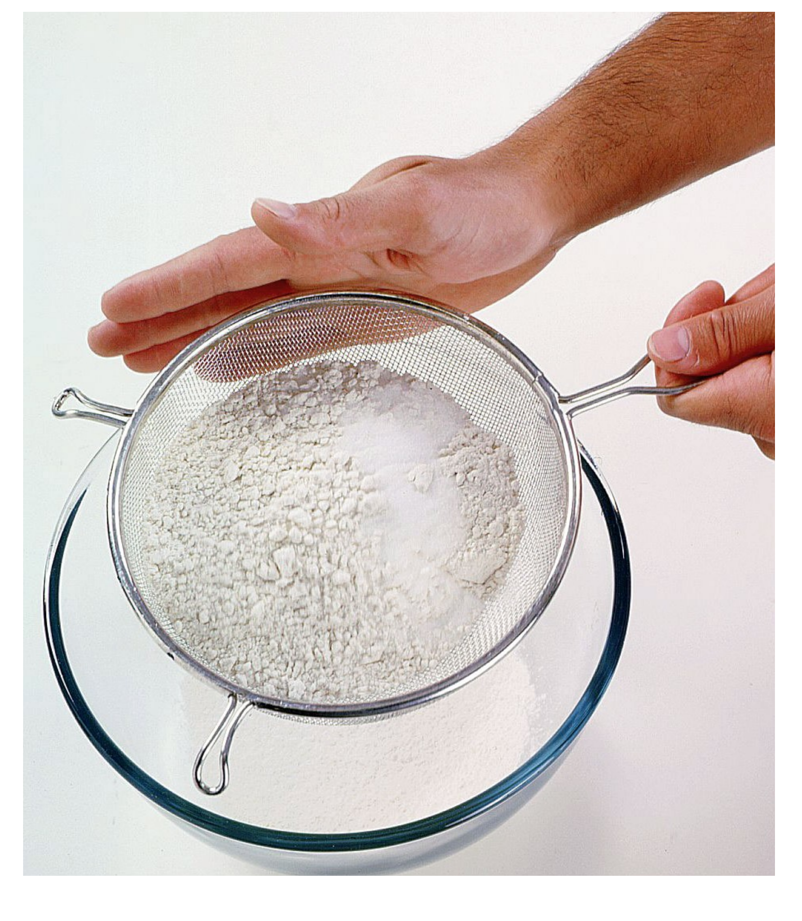
Sift the whole wheat flour to make white flour—removes the bran and the germ