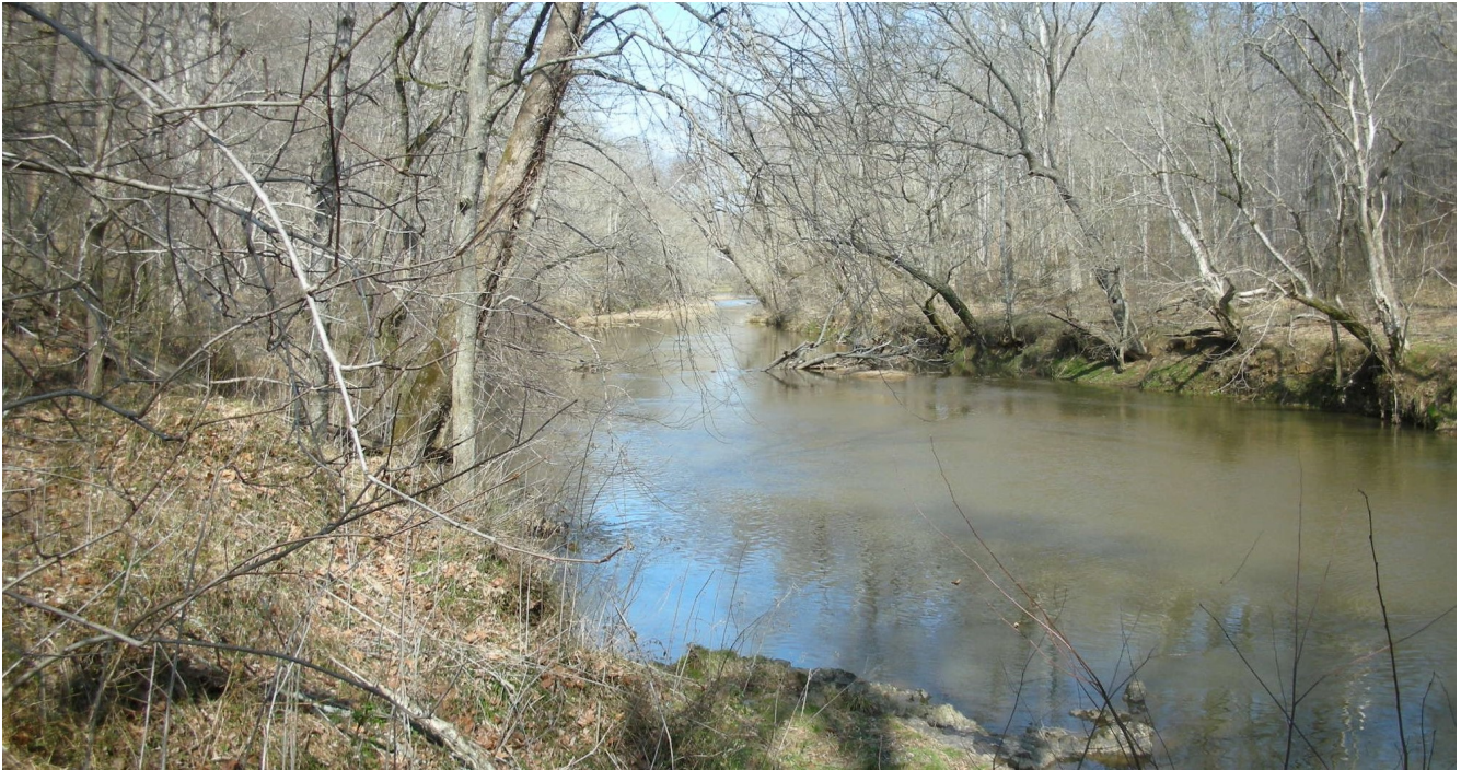
Caywood Farm preserves more than 3/4 mile adjacent to the Flat River, rated as nationally significant due to the rare aquatic species it supports.