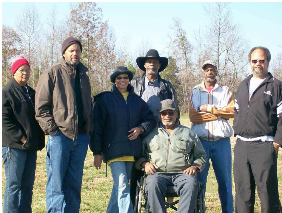
The Carrington siblings have worked hard to preserve their family farm in memory of their parents.

The farm is adjacent to Camp Butner (see map on back page), and shares over one-half mile of boundary with this state owned National Guard training area. The protection of this farm as permanent farmland will help to reduce future land use conflicts with Camp Butner. Durham and Granville counties have helped prepare the Camp Butner Land Use Plan which seeks to address reductions in future land use conflicts around this military training base. The plan recommends the purchase of conservation easements surrounding the camp borders to prevent future conflicts with new residential development.