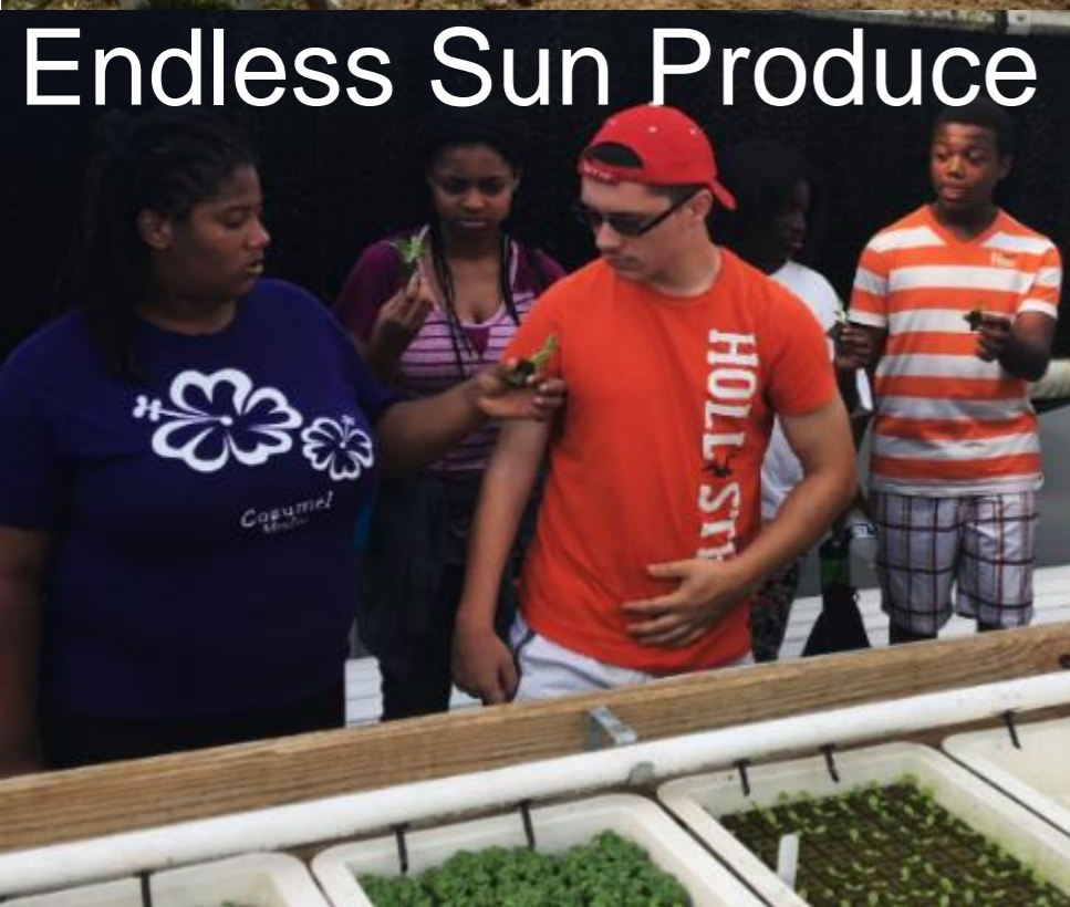
Endless Sun Produce