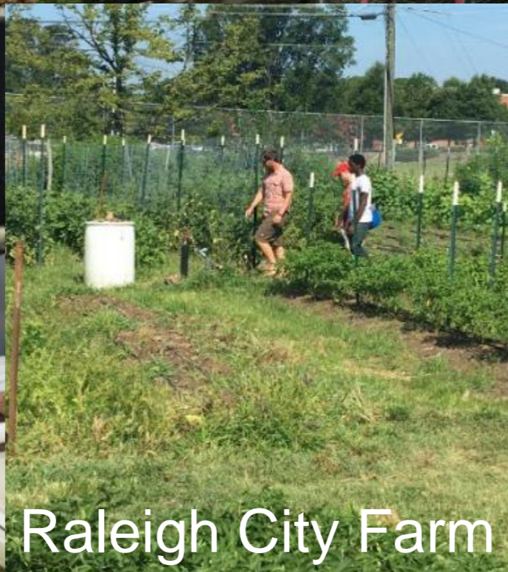
Raleigh City Farm