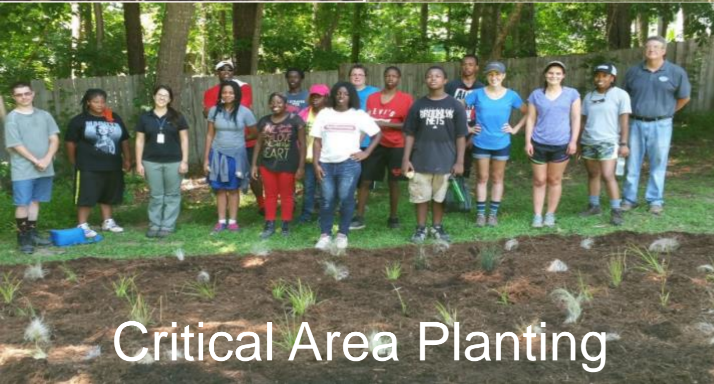
Critical Area Planting