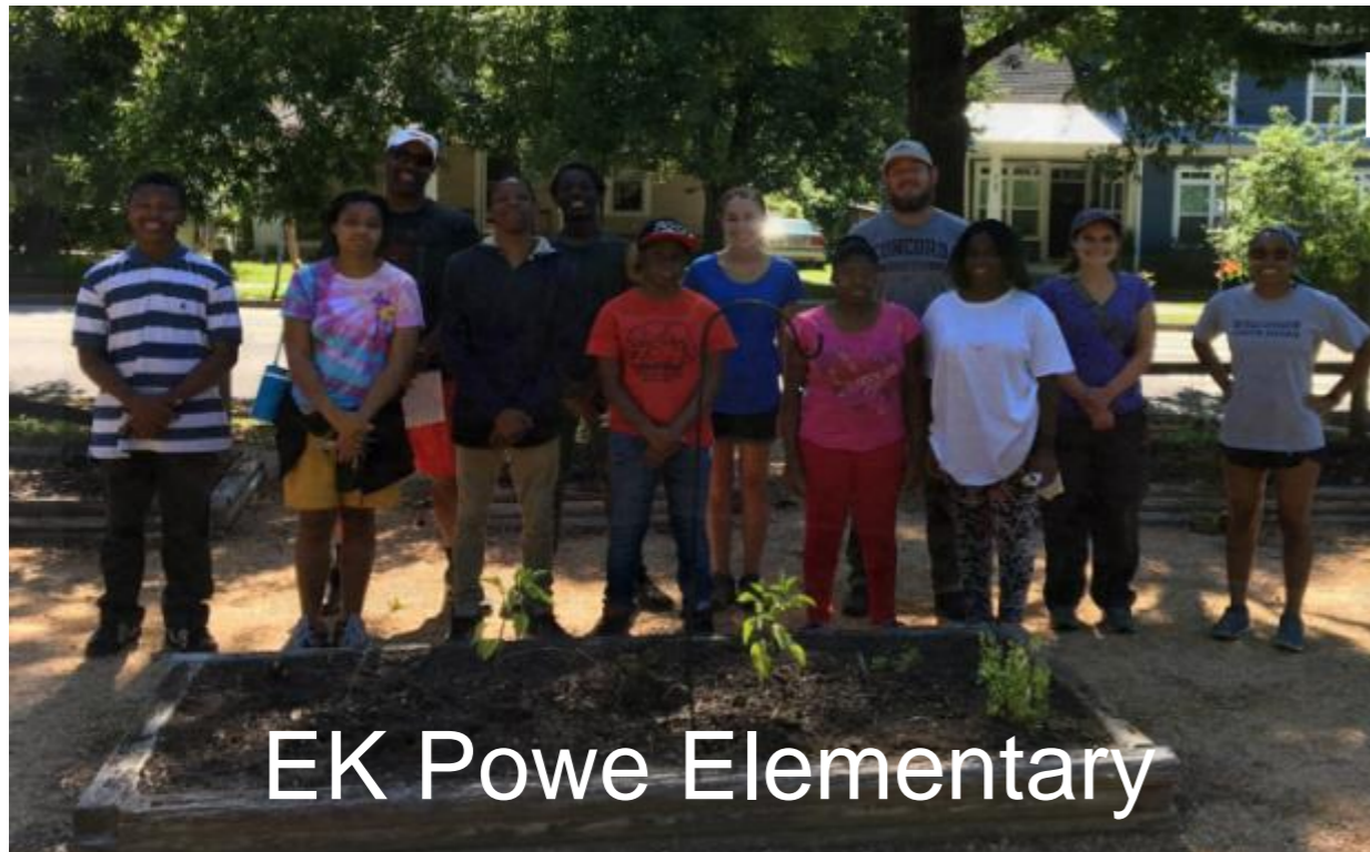
EK Powe Elementary