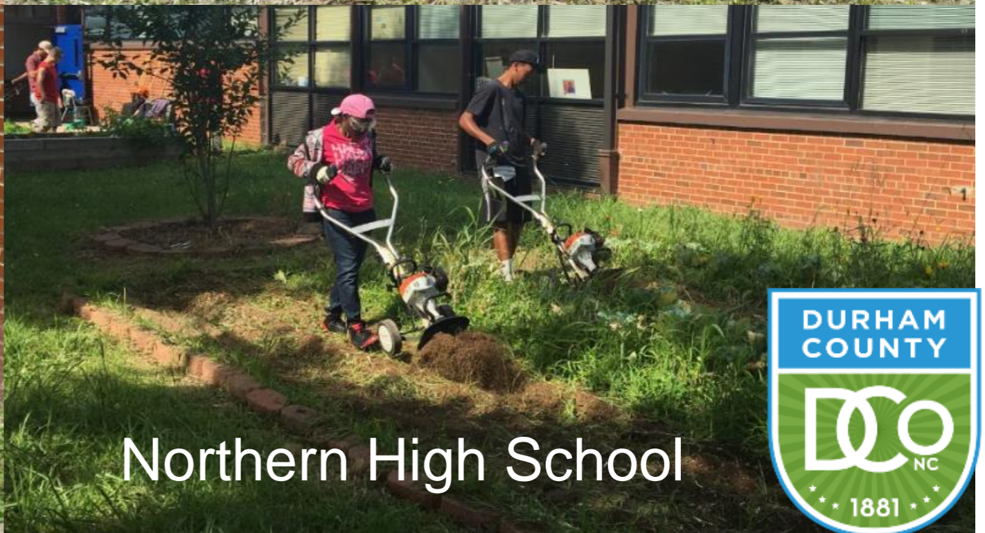
Northern High School