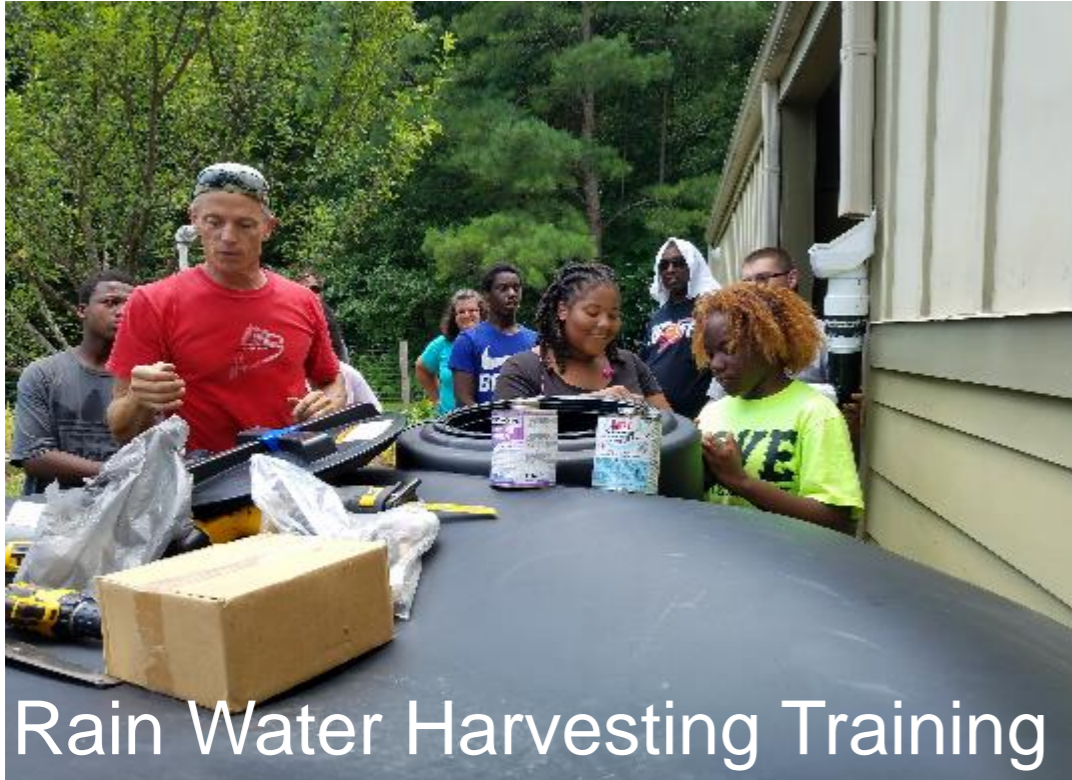
Rain Water Harvesting Training