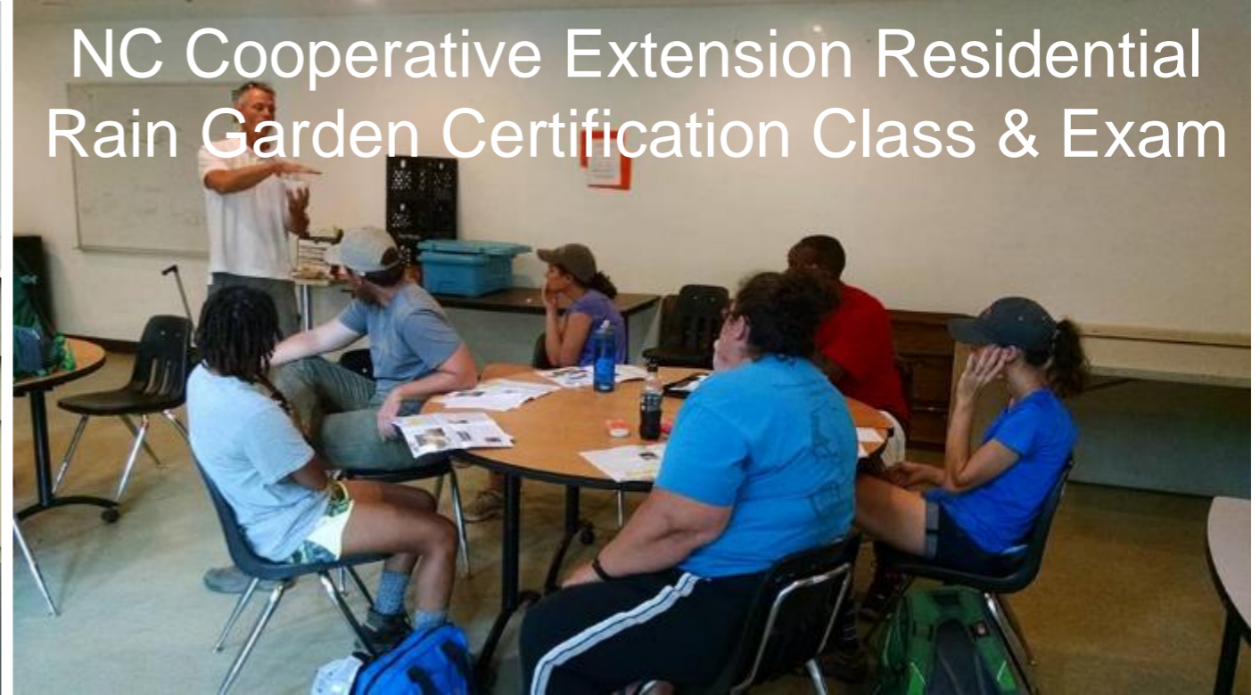
NC Cooperative Extension Residential Rain Garden Certification Class & Exam