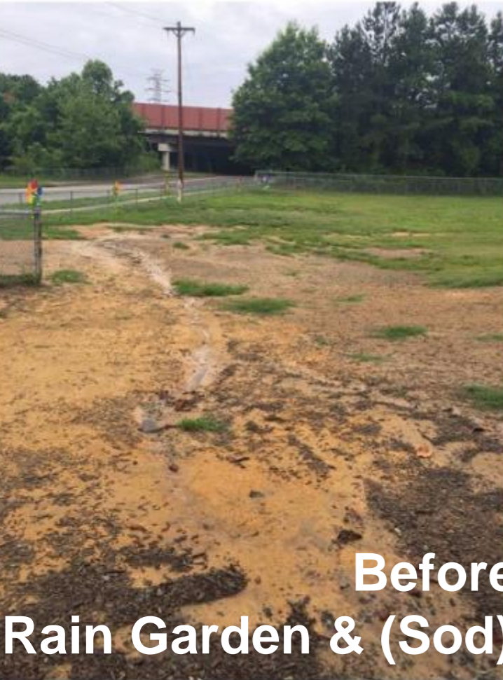
Before & After