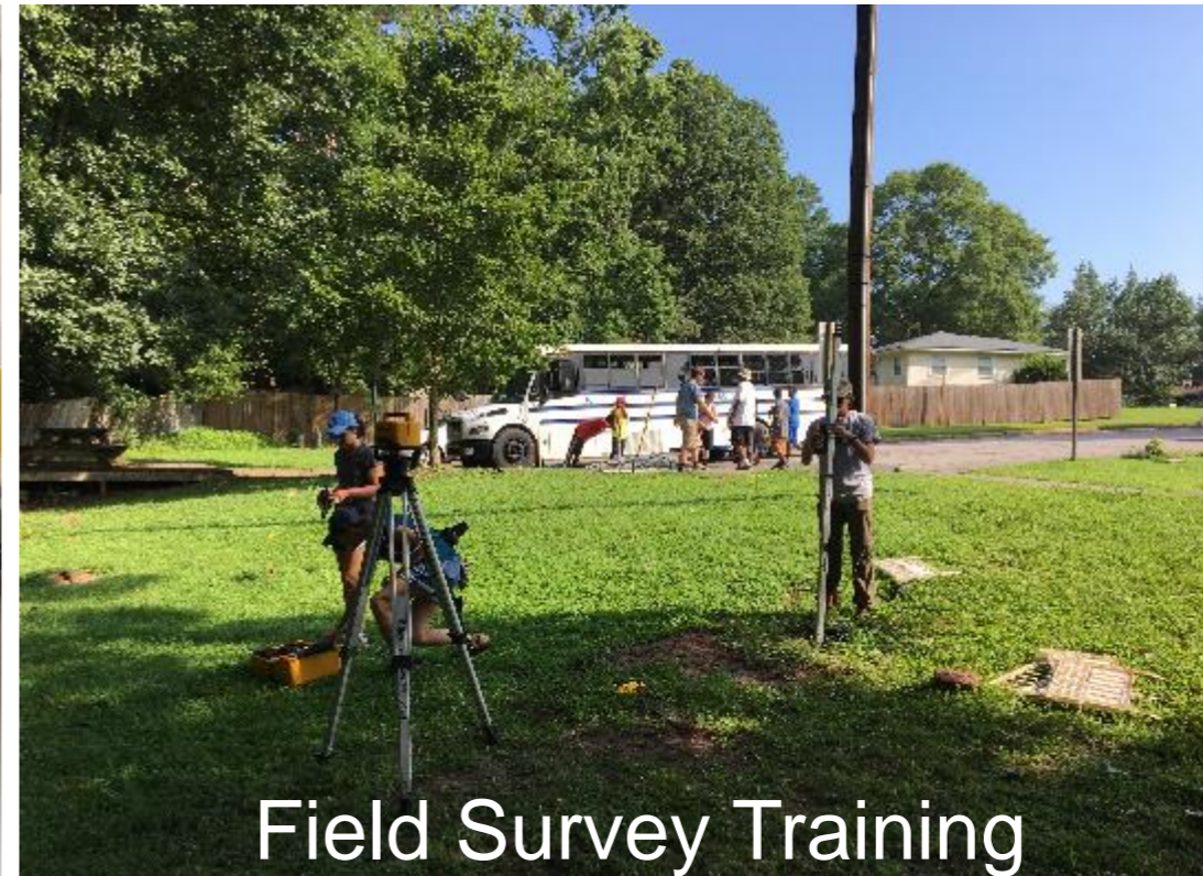
Field Survey Training