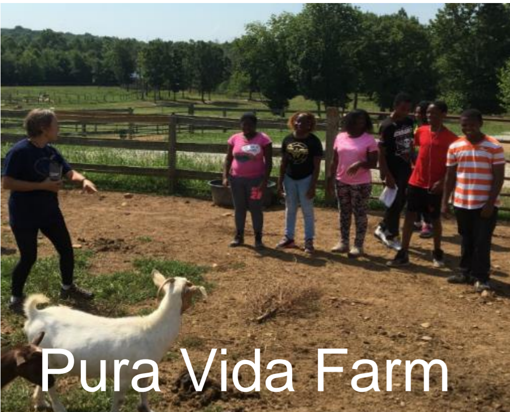
Pura Vida Farm