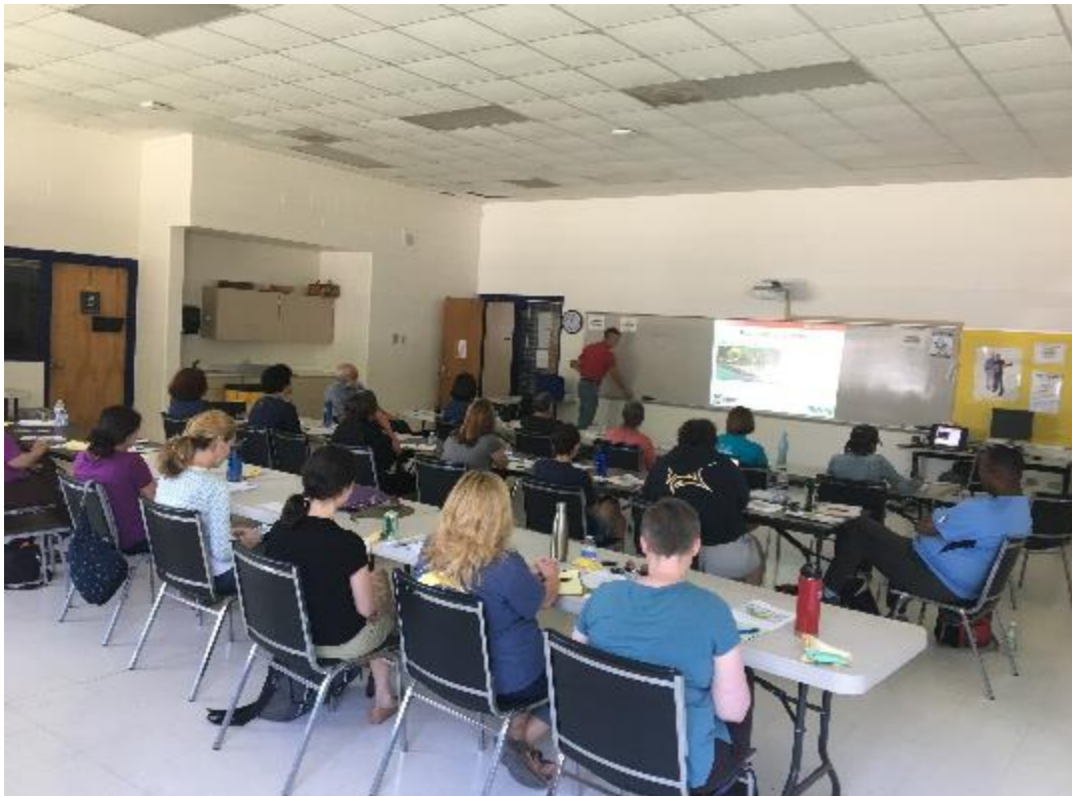
Field Survey Training