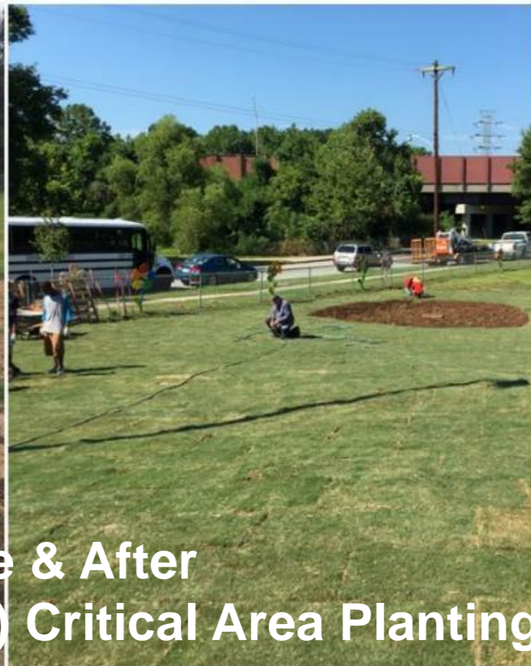
Rain Garden & (Sod) Critical Area Planting