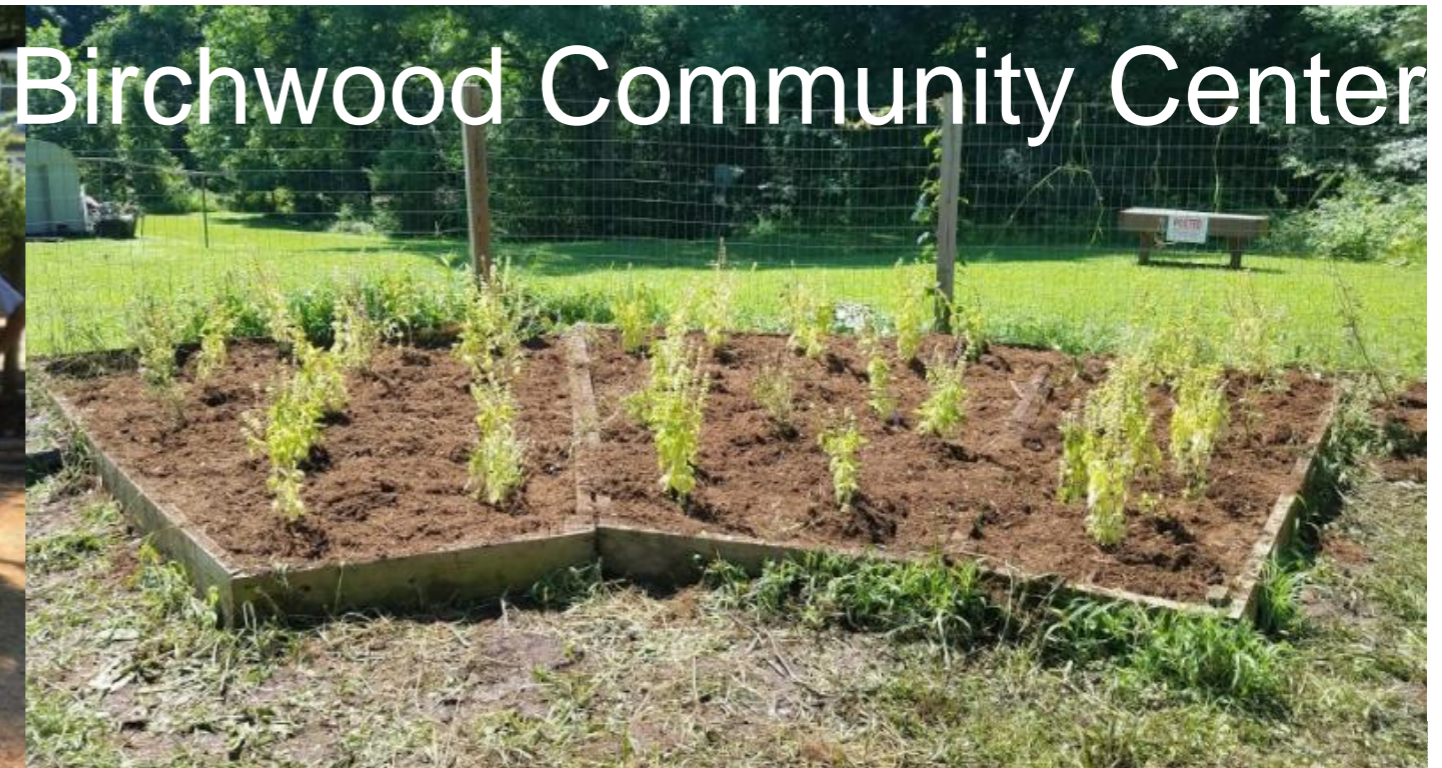
Birchwood Community Center