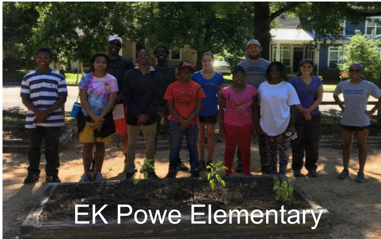
EK Powe Elementary