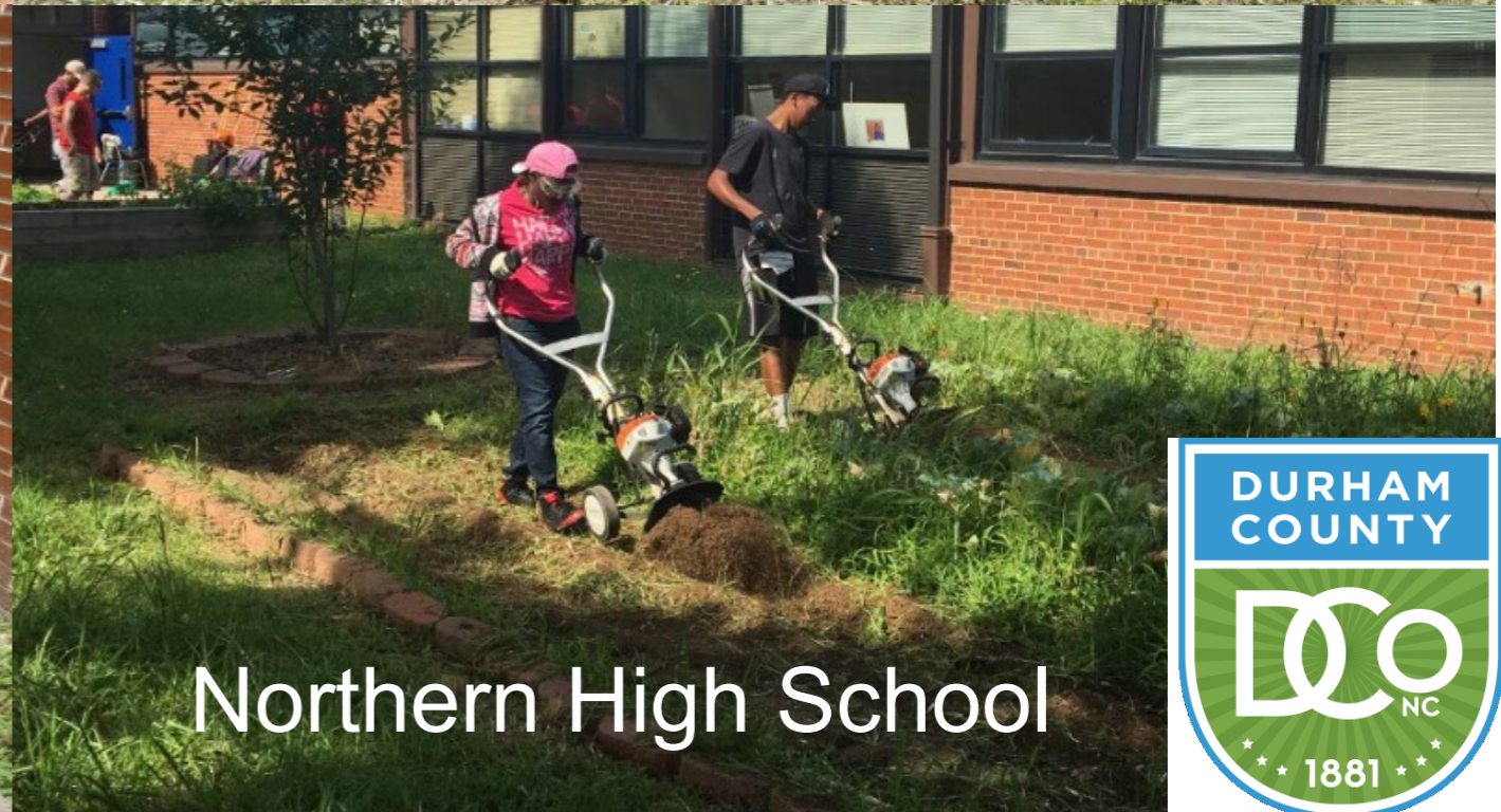
Northern High School