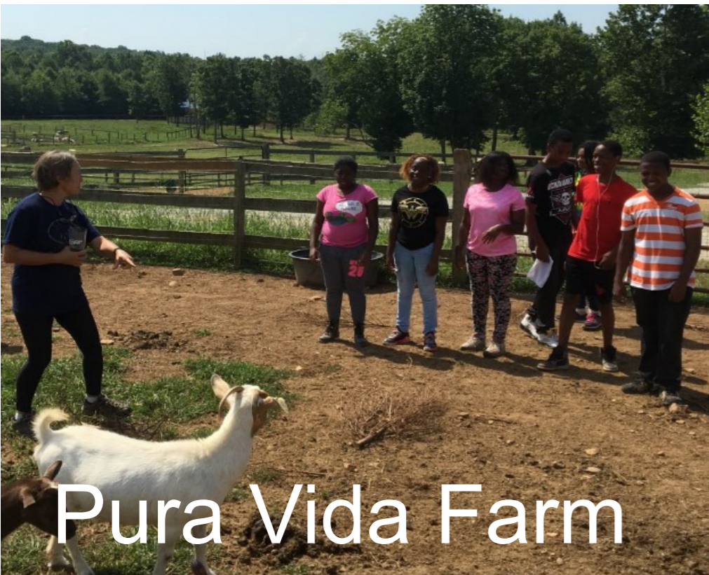
Pura Vida Farm