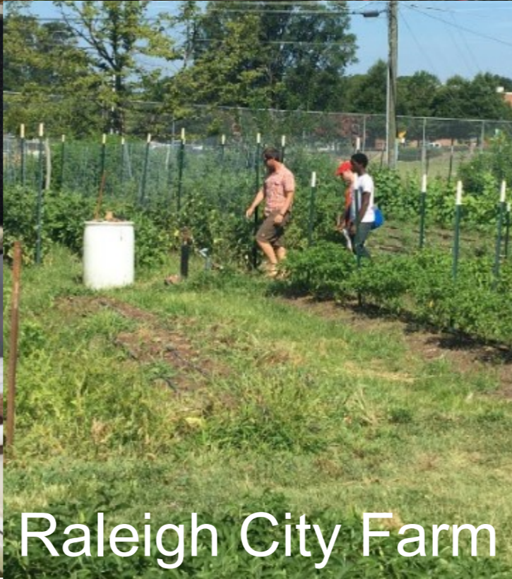
Raleigh City Farm