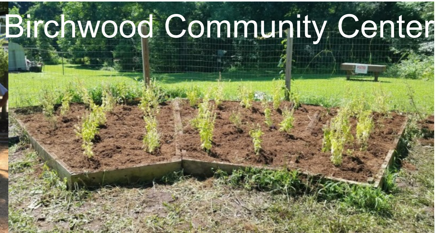
Birchwood Community Center