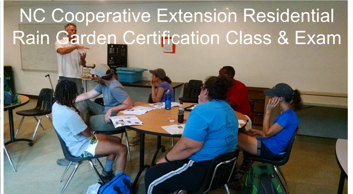
NC Cooperative Extension Residential Rain Garden Certification Class & Exam