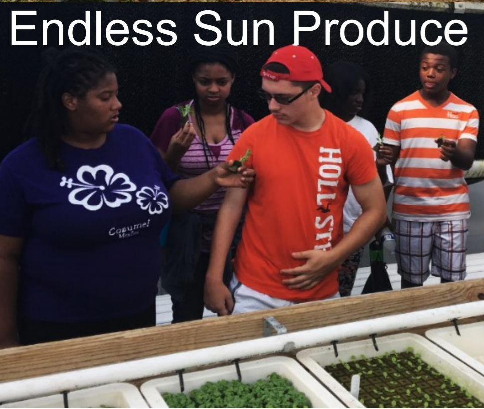
Endless Sun Produce