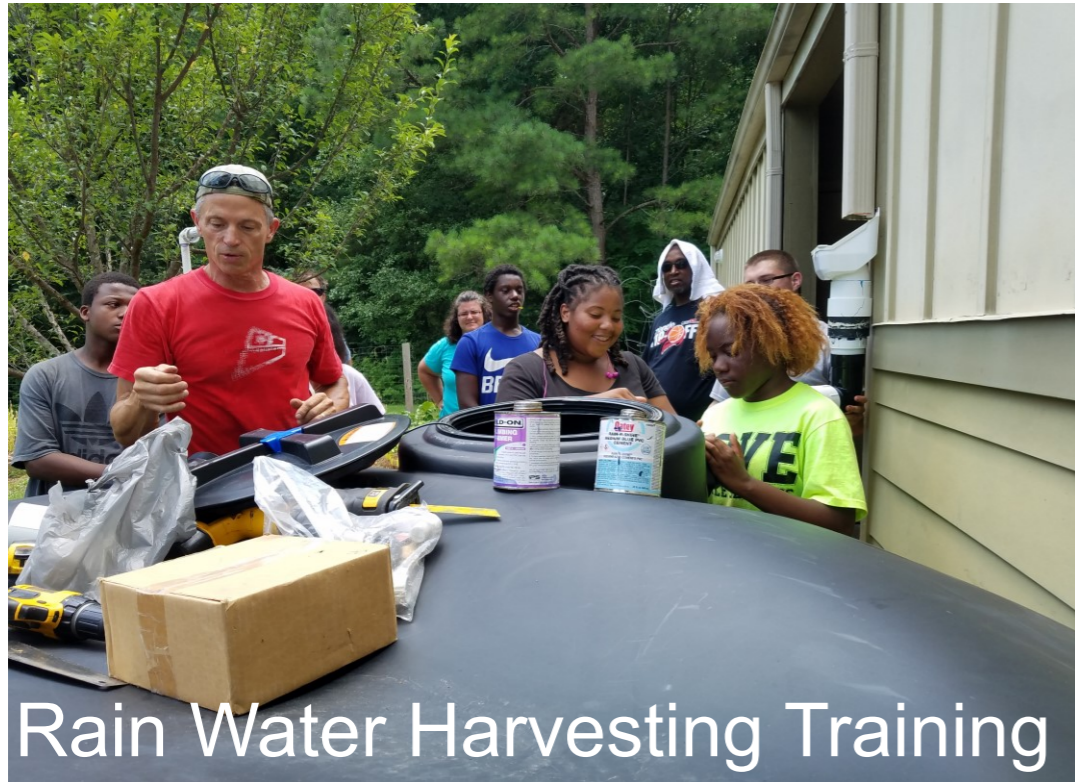
Rain Water Harvesting Training