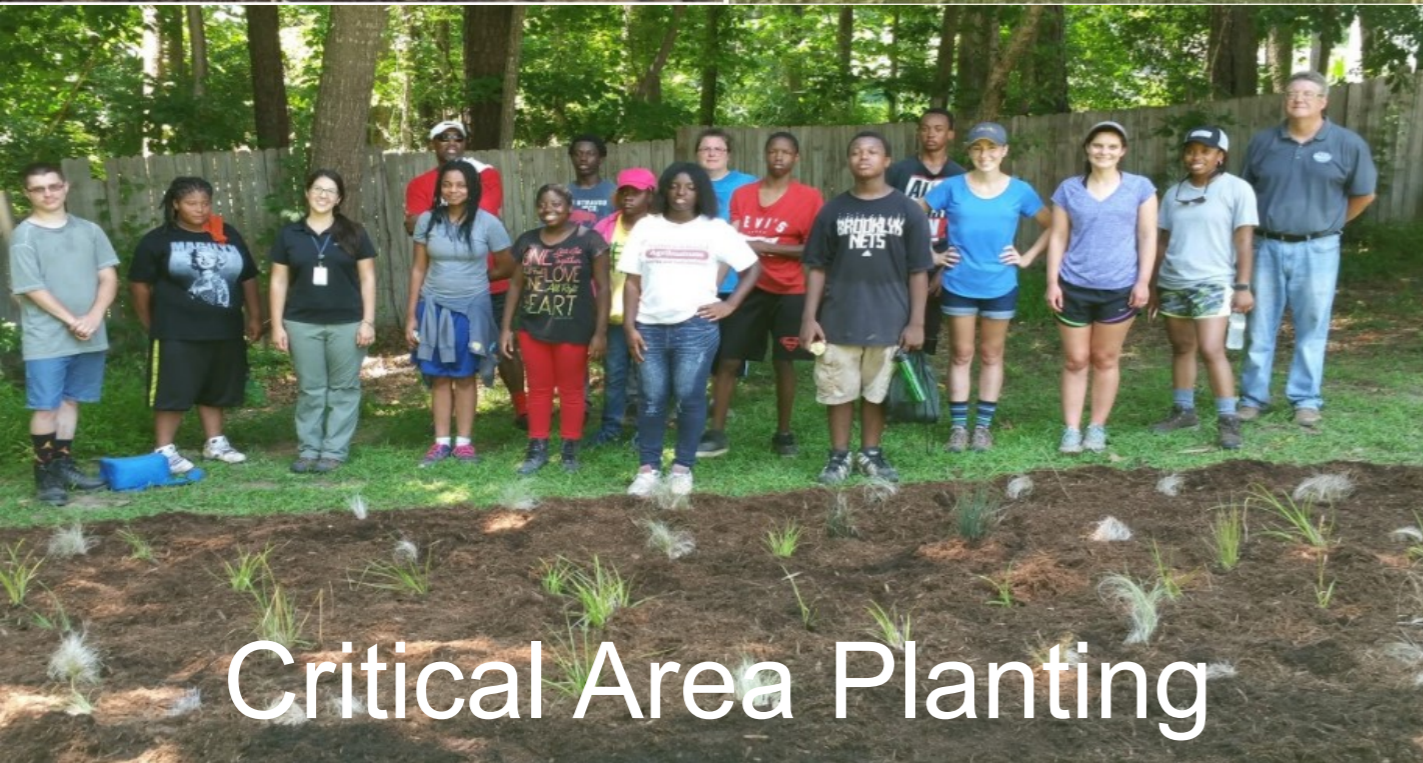
Critical Area Planting