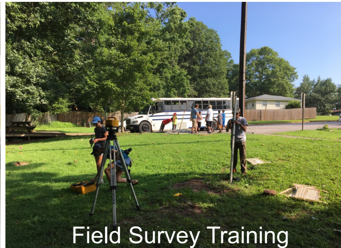
Field Survey Training