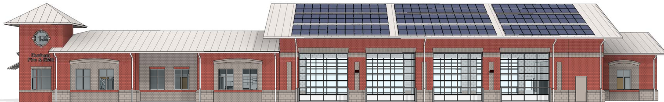
① STREET VIEW SKETCH

© 2016 BOBBITT A&E, LLC. ALL RIGHTS RESERVED. BOBBITT A&E, LLC. 600 GERMANTOWN ROAD, DURHAM, NC 27603. TEL: 919.486.1100. FAX: 919.486.1101. WWW.BOBBOBBO.COM