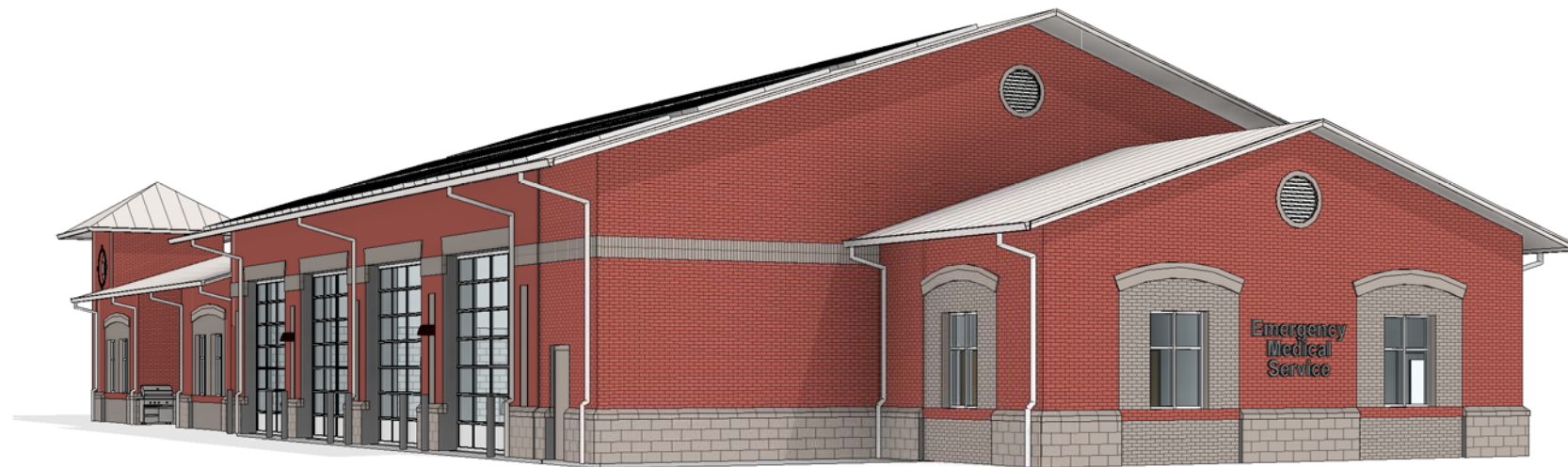
② EMS CORNER SKETCH