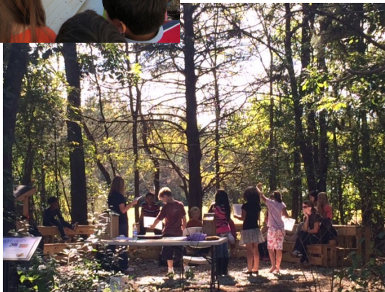
Scenes from Environmental Field Days