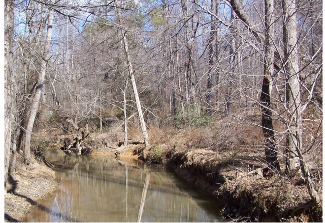
The floodplain along Buffalo Creek was preserved with the support of the NC EEP program at no cost to Durham County.

As new residential development continues to change Durham's rural landscape, Durham County has permanently protected a local family farm from development, helping to preserve important farmland along Poole Road in northwestern Durham with the acquisition of 50.3 acres of permanent conservation easements. This easement project is part of a larger open space preservation effort involving multiple efforts by both Durham and Orange counties that will protect approximately 83 acres in Durham County and another 70 acres in Orange County. The overall project includes approximately 1.5 miles of creek side buffers along Buffalo Creek, a major tributary to the Little River.